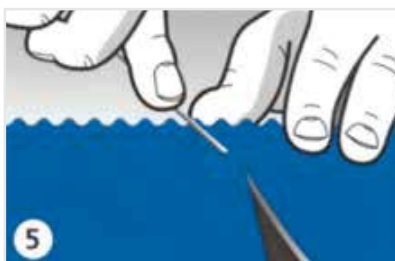
Press the ends back together firmly.