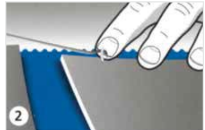
Pop the pin out at 1.5 cm from the edge.