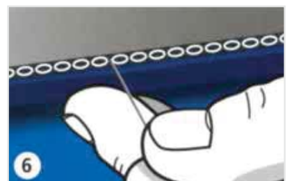
Pass the wire through and cut the excess.