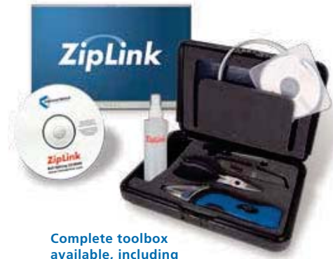
Complete toolbox available, including instruction CD

ZipLink® provides long life and flexibility for multiple applications. The belts can easily and quickly be changed without accruing significant downtime or expensive overtime. After converting to ZipLink®, time and personnel required to change belts may be reduced by more than half.