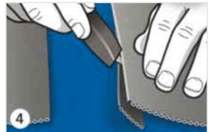
Carefully cut the top cover.