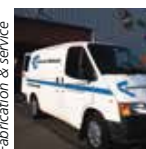
Fabrication & service