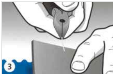
Gently pull the pin out using pliers.